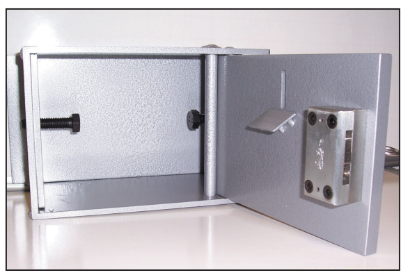
Safe adapted to collect coin - open